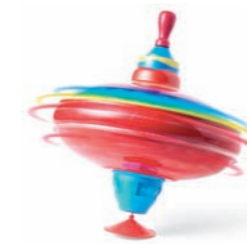
AIM Amsterdam Innovation Motor