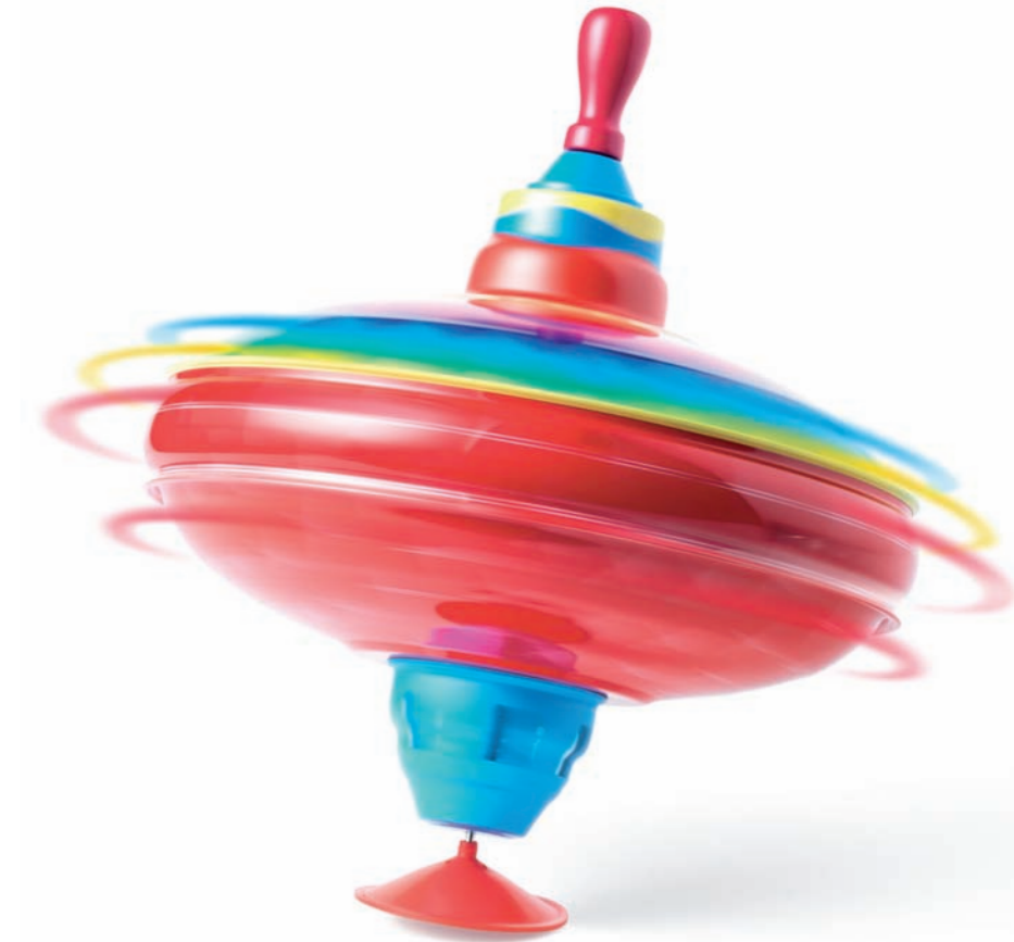
AIM Amsterdam Innovation Motor